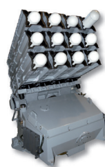
Versatile and modular ammunition launcher